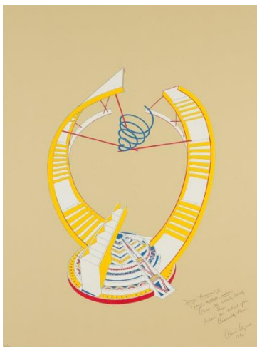
Miami Proposal Print I