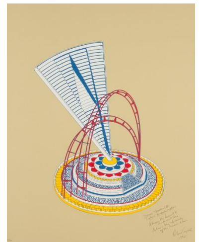
Miami Proposal Print IV