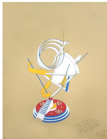
Miami Proposal Print III