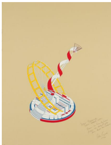
Miami Proposal Print II